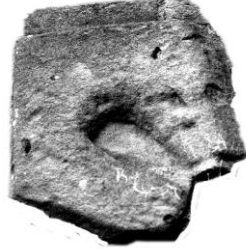
Believed to be a Bear's head