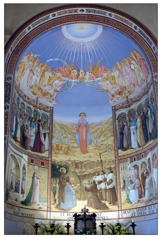
Upper church, art above the alter.

URING a holiday to the holy land we visited the Church of the Visitation in Ein Karem Israel.